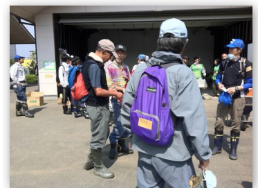
at Volunteer Center