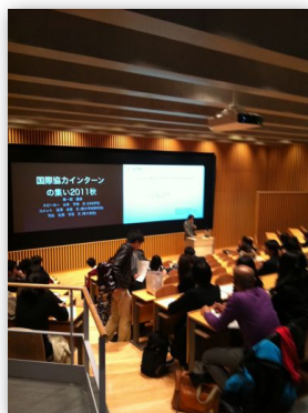
Lecture Hall, 21 Komcee

Supporter(s): UNHCR Representation in Japan; Global Compact Japan Network(GCJN); Japan Federation of Bar Association (JFBA); Japan Lawyers' Network for Refugees (JLNR); Human Rights Now (HRN)