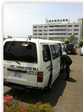
HSF Weekend Volunteer