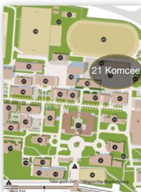
21 Komcee, Komaba Center for Educational Excellence, Komaba I Campus